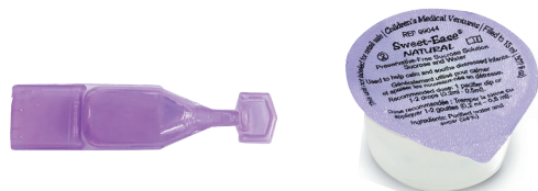
1 & 2 mL vials

The Sweet-Ease 24% sucrose and purified water solution is used to soothe the baby.